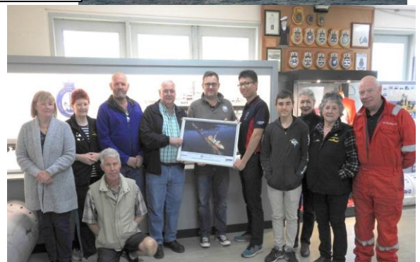
Below , representatives from PAME Spoolbase workforce, Sub Sea 7 and Cooper energy came to our museum and presented us with this beautiful picture of the Seven Oceans pipe laying ship.