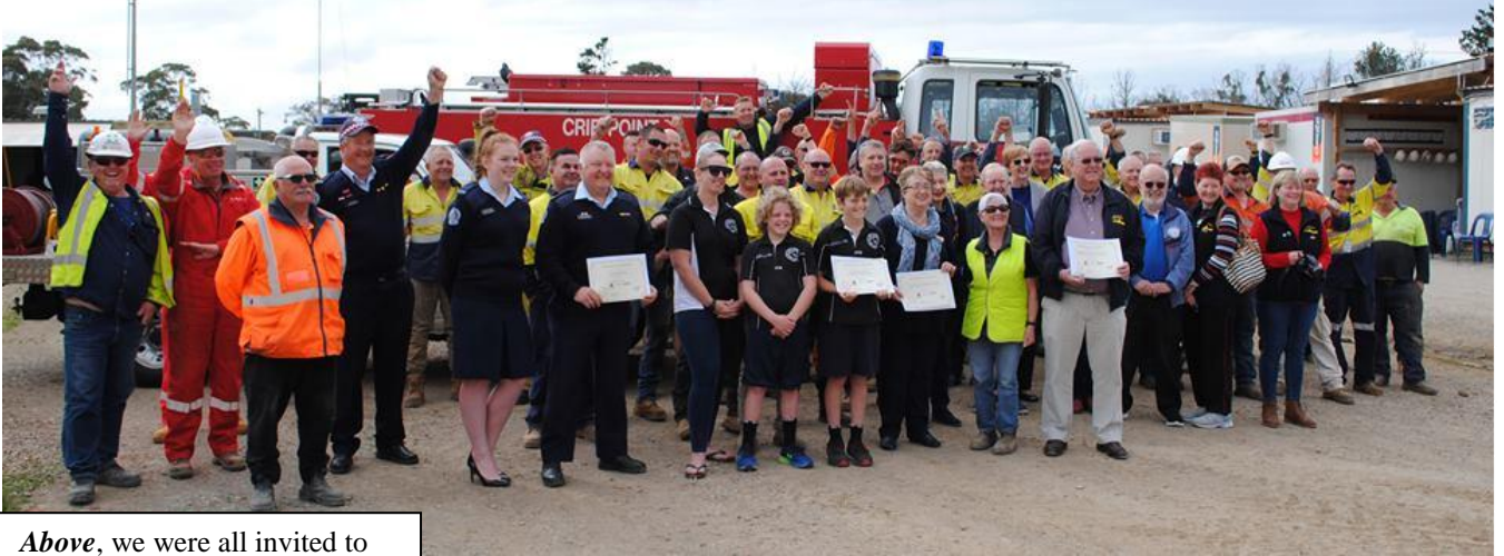
Above , we were all invited to the presentation and BBQ lunch.

For the last 9 months the PAME Spoolbase workforce, which is made up of several companies, Petroleum & Mining Engineering, Sub Sea 7 Shipping and Cooper energy have been working on fabricating a pipeline in the land behind our Museum. They made 67 kilometers of gas pipeline, then the pipe laying ship 7 Oceans came in to the Crib Point jetty and they loaded the pipeline, then the ship went out off the coastal township of Orbest and laid the pipeline. During the 9 months the workers held raffles and raised money which they donated to four local charities, Crib Point Fire Brigade, Crib Point Community House, Crib Point Junior Football/Netball Club, and us the Victorian Maritime Centre. Each one received $4,500. We will use this to pay for the new model cases. As a bonus we also gained 30 new members.