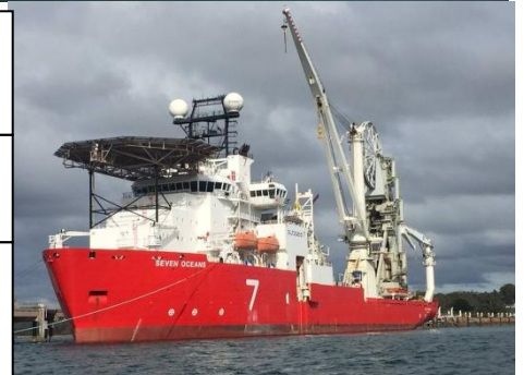
Right , the pipe laying ship Seven Oceans from the SubSea Company.