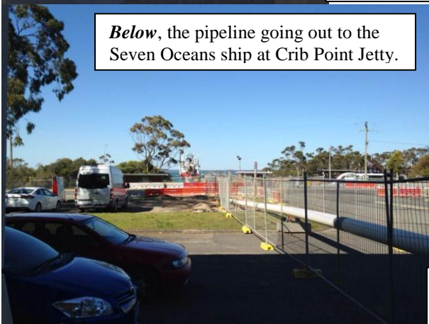
Below , the pipeline going out to the Seven Oceans ship at Crib Point Jetty.